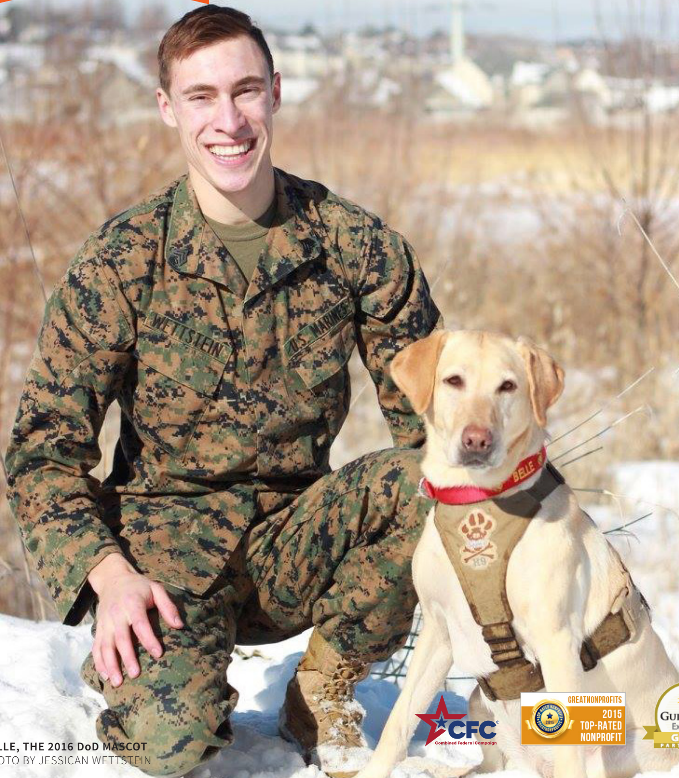
BELLE, THE 2016 DoD MASCOT