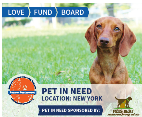
SOCIAL MEDIA PET IN NEED POST SAMPLE: available to Platinum and Gold Corporate Sponsors