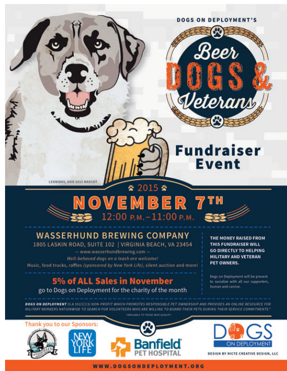
NATIONAL EVENT FLYER SAMPLE (HOSTED IN SELECT CITIES): available for most sponsor levels except Meritorious